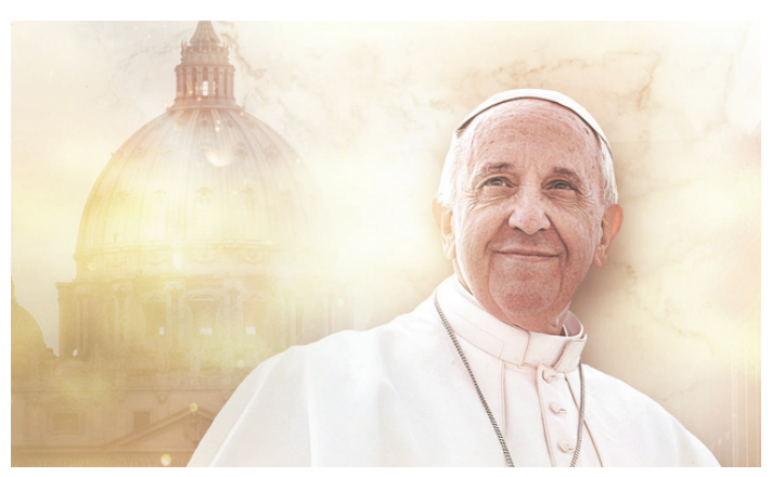
MASS FOR THE REPOSE OF THE SOUL OF POPE FRANCIS